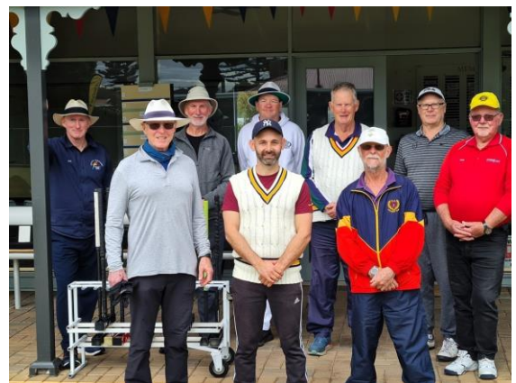
Entrants in the Brighton Armstrong Challenge 2023